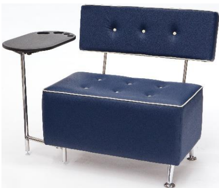
Add-on swiveling table for £180